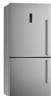
REF31BMXL + MASHK31BM