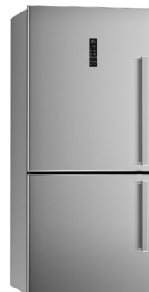
REF31BMXL + PROHK31BM