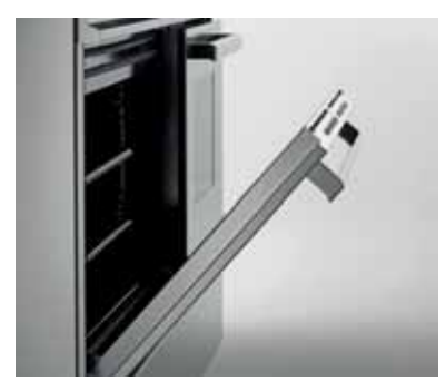
The soft-motion oven door is specially designed and carefully balanced for easy opening and smooth closing with one hand.