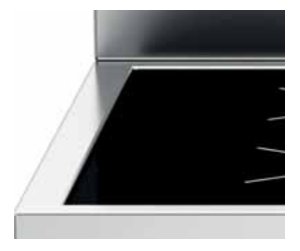
The 4-zones induction worktop with variable heat and power boost function accommodates full-size cookware for super-fast yet precise cooking.