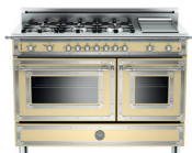
CREAM (CR) HER 48 6G GAS CR