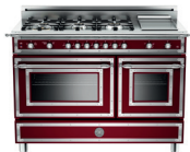
BURGUNDY (VI) HER 48 6G GAS VI