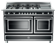
BLACK (NE) HER48 6G GAS NE

Color is an essential expression of Italian exuberance and artistic elegance. Bertazzoni celebrates these special qualities with three matt textured color choice surfaces inspired by the vintage styling of an original range design in the early 1900's.