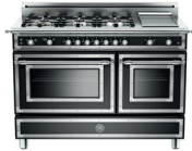
BLACK (NE) HER48 6G GAS NE

Color is an essential expression of Italian exuberance and artistic elegance. Bertazzoni celebrates these special qualities with three matt textured color choice surfaces inspired by the vintage styling of an original range design in the early 1900's.