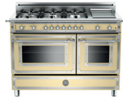
CREAM (CR) HER 48 6G GAS CR