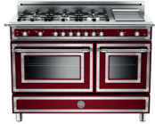
BURGUNDY (VI) HER 48 6G GAS VI