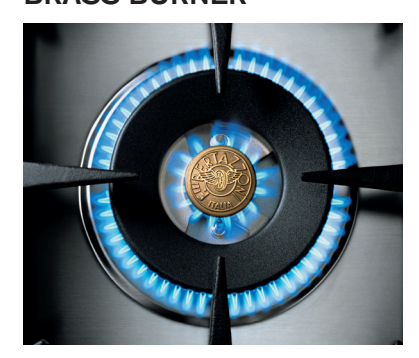
Bertazzoni's exclusive power burners in brass have independently operated flame rings giving maximum flexibility of operation from delicate low simmer to full power.