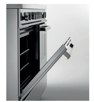
The soft-motion oven door is specially designed and carefully balanced for easy opening and smooth closing with one hand.