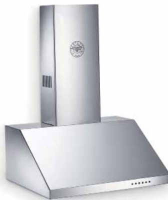
Single motor canopy hood shown with optional narrow duct cover.