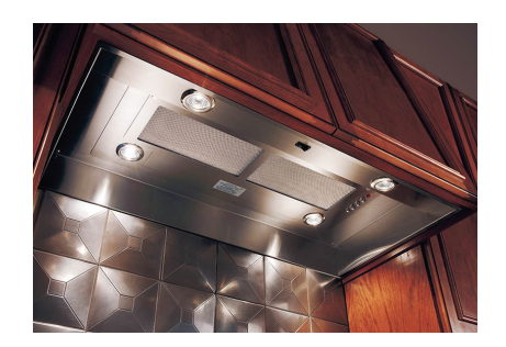
Both installations are shown with optional liners.