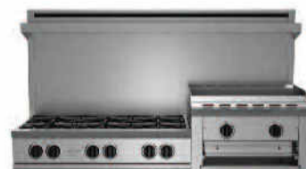
60" Heritage Classic