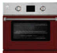
30" Drop Down Door