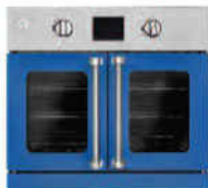
30" French Doors

Features a built-in artisan baking stone with precise temperature control, touch screen control panel with 12 cooking modes (including StoneBake™, True European Convection & Sabbath), Infrared Broiler, eco-friendly Continu Clean™ and an extra-large cavity that fits a commercial size baking sheet.