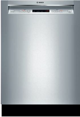
SHE4AV55UC Stainless Steel