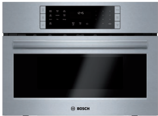
HMC87151U Stainless Steel

The speed microwave oven pairs the cooking qualities of a conventional oven with the speed of microwave technology.