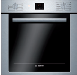
HBE5451UC Stainless Steel

The 24" Bosch Wall Oven features Genuine European Convection and is Designed for Kitchens with a Smaller Footprint