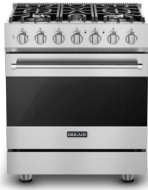
Dual Fuel Self-Clean Range 30"W.