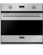
Electric Single Oven 30"W.