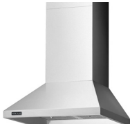
Chimney Wall Hood 30" and 36" widths available