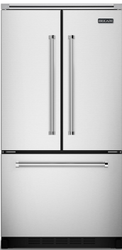
French-Door Bottom-Freezer 36"W.