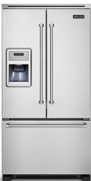
French-Door Bottom-Freezer with Ice and Water Dispenser 36"W.