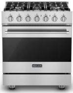
Gas Self-Clean Range 30"W.