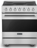
Electric Self-Clean Range 30"W.