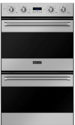
Electric Double Oven 30"W.