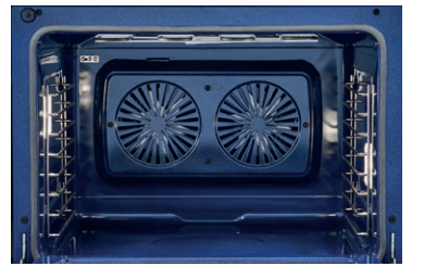
CustomConvect<sup>3™</sup> Convection Technology Distributes heat evenly throughout the oven by adding a third cooking element plus variable speed fans.