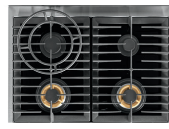
Flexible Cooktop Configuration The cooktop offers a wide range of burner sizes, giving you more flexibility so you can create a multi-course meal at once.