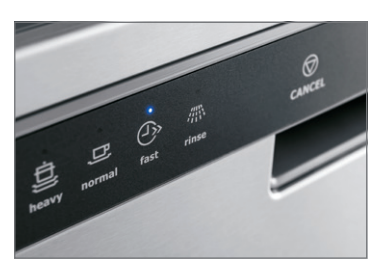
30-MINUTE FAST WASH CYCLE Thoroughly cleans in just 30 minutes.