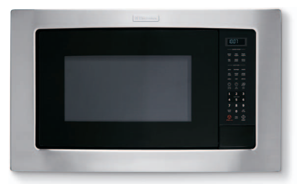
Microwave includes choice of 30" or 27" Trim Kit available (shown with 30" Stainless Steel Trim Kit).