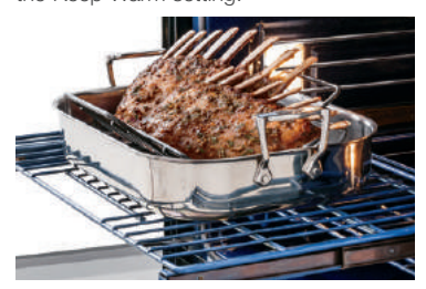
Self-Cleaning Porcelain Racks Bake, roast, broil, savor — the cleaning's on us. Our porcelain racks are safe to stay inside of the oven during the self-clean cycle, eliminating the mess and inconvenience of removing and cleaning racks by hand.