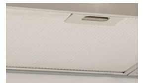
Anodized Aluminum Mesh Filters