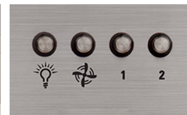
Stainless Steel Push Button Controls