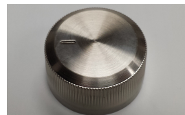
Stainless Rotating Knob Controls