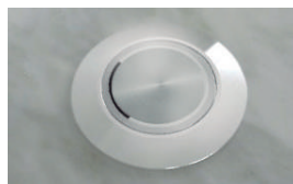
Electronic Rotating Disc Controls