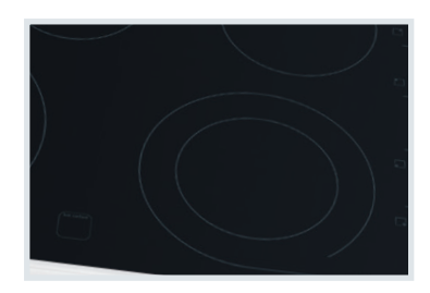
SpaceWise® Expandable Elements Flexible elements expand to your cooking needs.