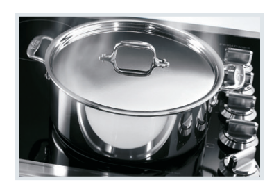
Quick Boil Boils water faster.