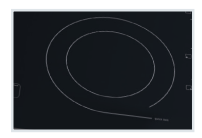
SpaceWise® Expandable Elements Flexible elements expand to your cooking needs.