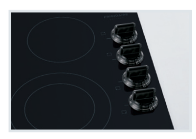
Express-Select® Controls Easily go from warm to boil.