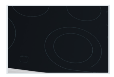
SpaceWise® Expandable Elements Flexible elements expand to your cooking needs.