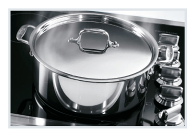
Quick Boil Boils water faster.