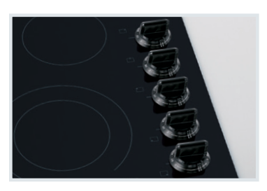
Express-Select® Controls Easily go from warm to boil.