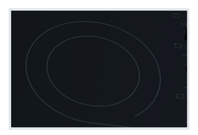
SpaceWise® Expandable Elements Flexible elements expand to your cooking needs.