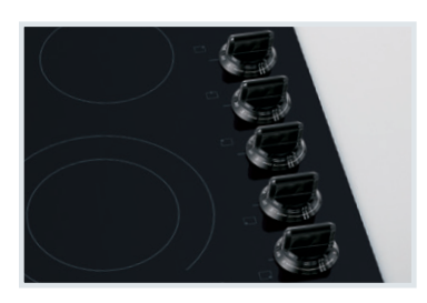
Express-Select® Controls Easily go from warm to boil.