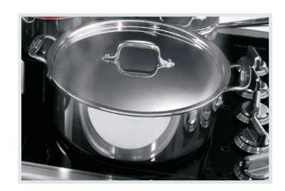
Quick Boil Boils water faster.