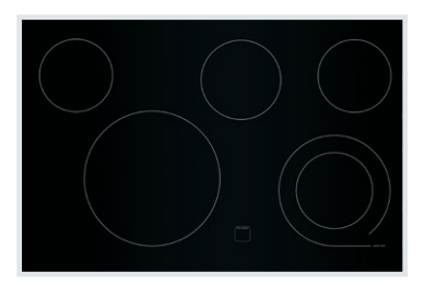
Ceramic Glass Cooktop For a more beautiful cooktop that's easy to clean.