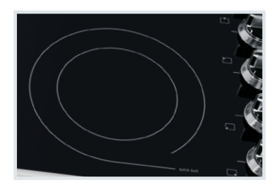
SpaceWise® Expandable Elements Flexible elements expand to your cooking needs.