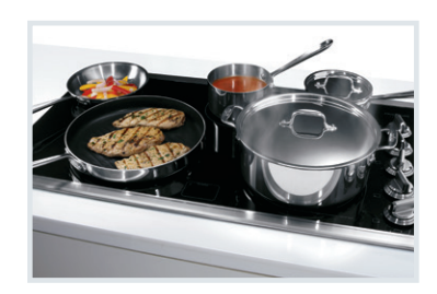
Fits-More™ Cooktop The Fits-More™ cooktop features five elements so you can cook more at once.