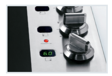
Pro-Select® Controls Precise control at your fingertips.