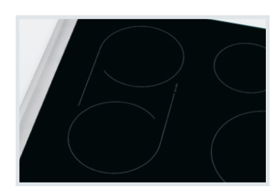
SpaceWise® Bridge Element A flexible element lets you combine two elements into one to fit larger cookware.