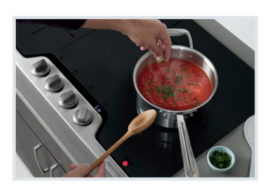
Gas Benefits, Without the Remodel

Our PowerPlus™ Induction Cooktop offers the the speed, control and consistency of gas, without requiring the converting of your kitchen from electric to gas.