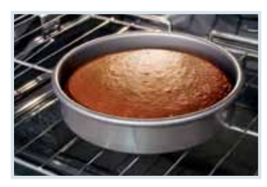
Quick Bake Convection Bake faster and more evenly with Quick Bake Convection.