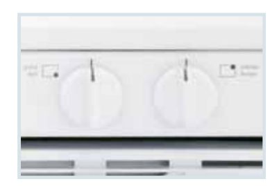
Express-Select™ Controls Easily go from warm to boil.