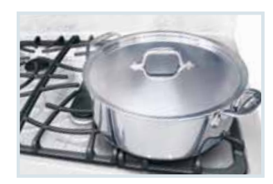
Quick Boil Boil water faster with our 17,000-BTU burner.