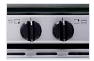
Express-Select™ Controls Easily go from warm to boil.