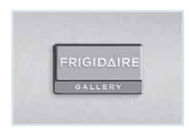
Real Stainless Steel Real stainless steel with a protective coating that reduces fingerprints and smudges so it's easy to clean.