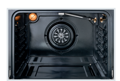
One-Touch Self-Clean Your oven cleans itself - so you don't have to. Self clean options available in 2- and 3-hour cycles.