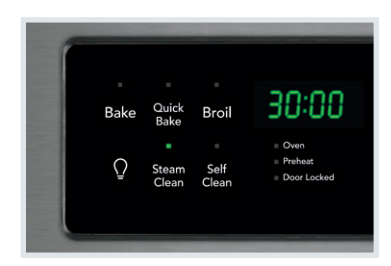
Steam Cleaning A 30-minute light oven cleaning that's chemical-free, odour-free, and fast.