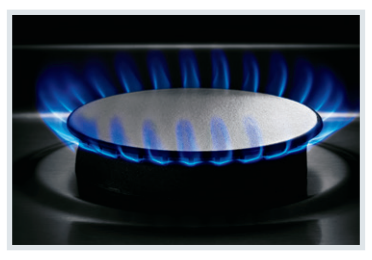
Power Burner Power Burner offers more power and faster boil time with 17,000 BTU burner