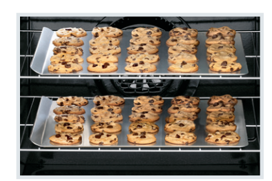
Quick Bake Convection Bake faster and more evenly with Quick Bake Convection.