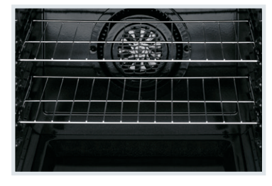
One-Touch Quick Self Clean Your oven cleans itself — so you don't have to. Self clean options available in 2-, 3- and 4-hour cycles.