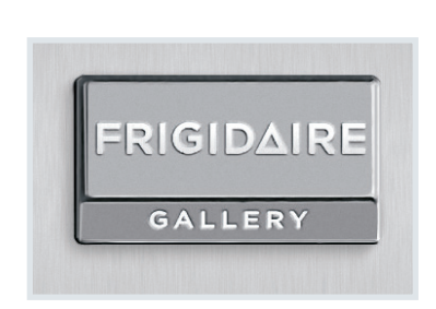
Smudge-Proof™ Stainless Steel Resists fingerprints and cleans easily.