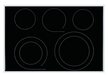
Fits-More™ Cooktop with SpaceWise® Expandable Elements

The cooktop features five burners including two SpaceWise® Expandable elements and a Warming Zone so you can cook more at once.