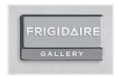
Smudge-Proof™ Stainless Steel

Single convection fan circulates hot air throughout the oven for faster and more even multi-rack baking.