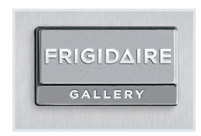
Smudge-Proof™ Stainless Steel

Single convection fan circulates hot air throughout the oven for faster and more even multi-rack baking.