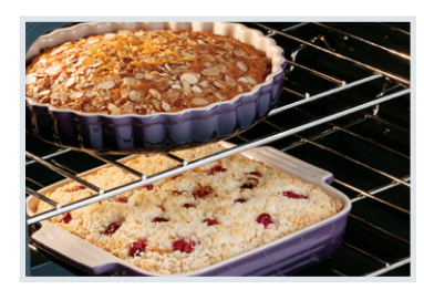
PowerPlus® Convection Powerful performance delivers consistent results. Evenly cooked dishes, every time, with PowerPlus® Convection bake and roast.