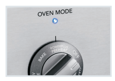
PowerPlus® Preheat With PowerPlus® Preheat, your oven is ready in a few minutes for a powerful start to every delicious meal.