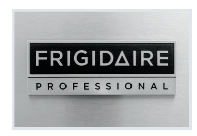
Smudge-Proof™ Stainless Steel Resists fingerprints and cleans easily.