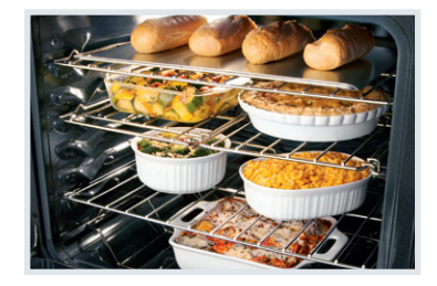
Fits-More<sup>™</sup> Oven More cooking space — plus even cooking.