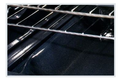
PowerPlus® Clean Heavy-duty self cleaning with 25% more cleaning power.