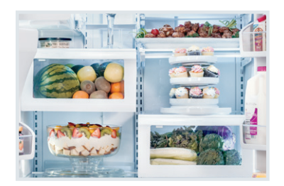
Adjustable Interior Storage Over 100 ways to organize and customize your refrigerator.