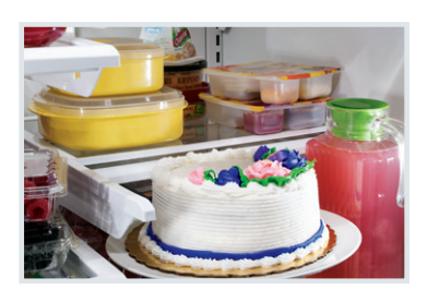
SpillSafe® Flip-Up & Slide-Under Shelves

Easily make room for tall or large items with the new Flip-Up and Slide-Under Shelves.