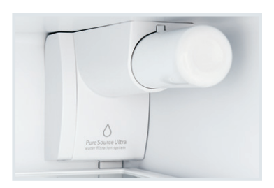
PureSource Ultra® Ice & Water Filtration Discover how our genuine filtration works to keep your water cleaner.