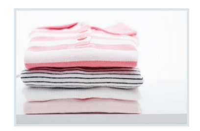
DrySense™ Technology Dries your clothes more precisely, reducing wrinkles.