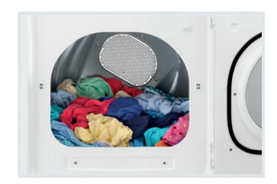
Fits-More™ Dryer Dry more in one load with our large, 7.0 cu.ft. interior.