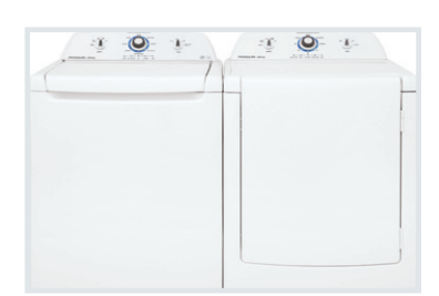
TimeWise® Technology TimeWise® Technology ensures wash time equals dry time — so you don't wait for clothes to dry.