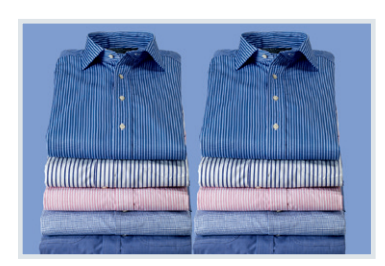
One-Touch™ Wrinkle Release This option features Wrinkle Release Technology that finishes by tumbling without heat, preventing wrinkles, so your clothes look great every time.