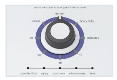
Express-Select® Controls Easily select options with the touch of a button.