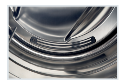
DrySense™ Technology Dries your clothes more precisely, reducing wrinkles.