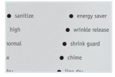
Energy Saver Option Reduces energy use up to 20%.<sup>1</sup>