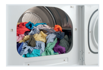
Fits-More™ Dryer Dry more in one load with our large, 7.0 cu.ft. interior.