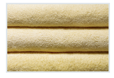
Quick Dry Dries even extra-large loads quickly and efficiently.