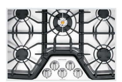
Heavy-Duty Grates and Professional-Style Knobs