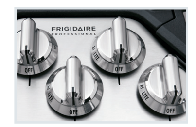
Pro-Select® Controls Precise control at your fingertips.