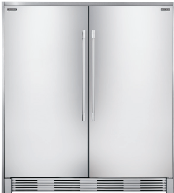
Shown with companion, All-Freezer model FPFU19F8RF and optional coordinated Dual 75" Collar Trim Kit (TRIMKITEZ2).