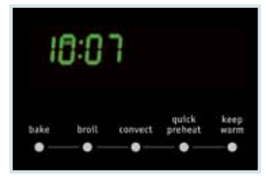
Keep Warm Setting Keep food warm until everything – and everyone – is ready.