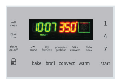
PowerPlus® Preheat Preheat in less than six minutes.¹