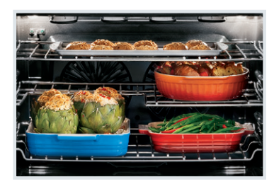
PowerPlus® Dual Convection With our dual convection fan system, the heat is evenly circulated for faster and more even baking and roasting.