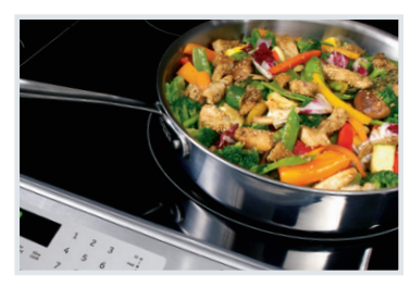
Largest Total Cooktop Capacity Cook more at once with our SpaceWise® expandable elements.