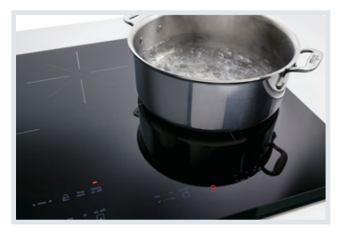
More Responsive Cooking with induction is more responsive than gas or electric so you can easily go from simmer to boil.