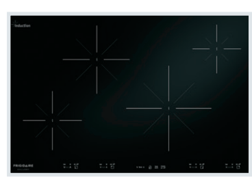
Versatile Induction Elements With up to five powerfully efficient induction elements, the Induction Cooktop offers the superior cooking flexibility. And the 10" induction element offers up to 3,400 watts of power, so you can bring water to a boil quickly.