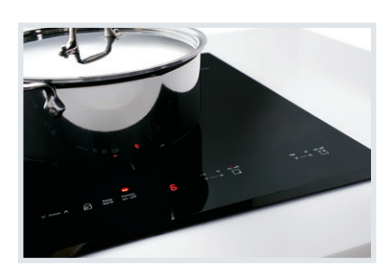
More Energy-Efficient Cooking with induction is 70% more efficient than gas and 20% more efficient than electric.