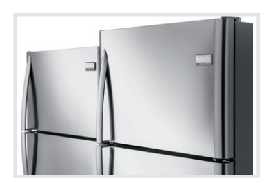
Same Width. More Capacity.¹ With a 20 cu.ft. top freezer refrigerator, you can have a refrigerator that fits the same space as an 18 cu.ft. top freezer refrigerator, but get more capacity.

Our humidity-controlled crisper drawers are designed to keep your fruits and vegetables fresh so you don't have to worry about stocking up.