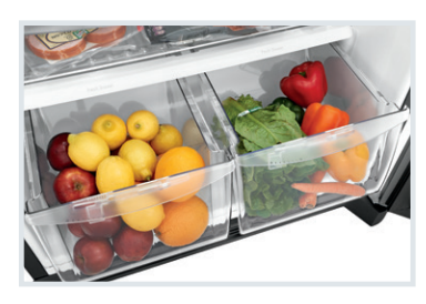
Humidity-Controlled Crisper Drawers

Our humidity-controlled crisper drawers are designed to keep your fruits and vegetables fresh so you don't have to worry about stocking up.