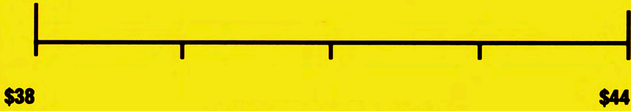
Cost Range of Similar Models

420 kWh Estimated Yearly Electricity Use