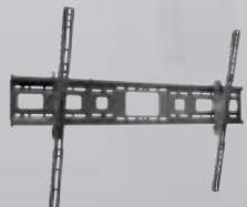
3-plate configuration for screens 50"-71"