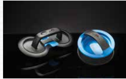
GOURMET BURGER PRESS KIT