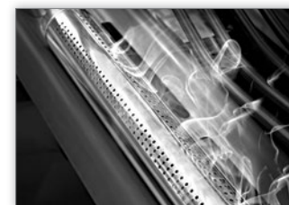
Smoker Pipe 67011