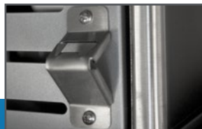
Integrated Bottle Opener