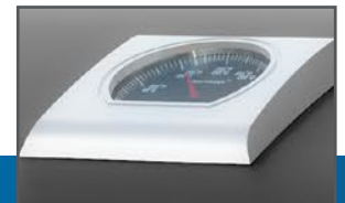
ACCU-PROBE™ Temperature Gauge