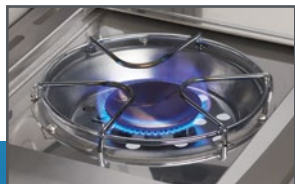
Range Side Burner