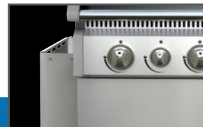
Folding Side Shelves