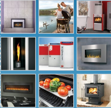
Fireplace Inserts • Charcoal Grills • Hybrid Furnaces • Outdoor Fireplaces Gas Furnaces • Gas Fireplaces • Electric Fireplaces • Accessories • Wood Stoves