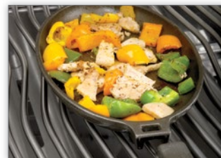
Professional Cast Iron Skillet 56003