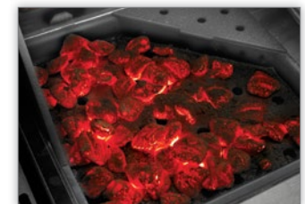
Charcoal Smoker Tray 67731