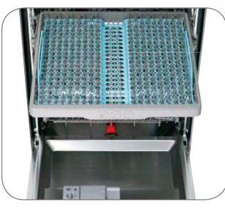
Third Rack with FlexTray™