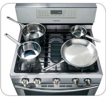
Five Burner Cooktop